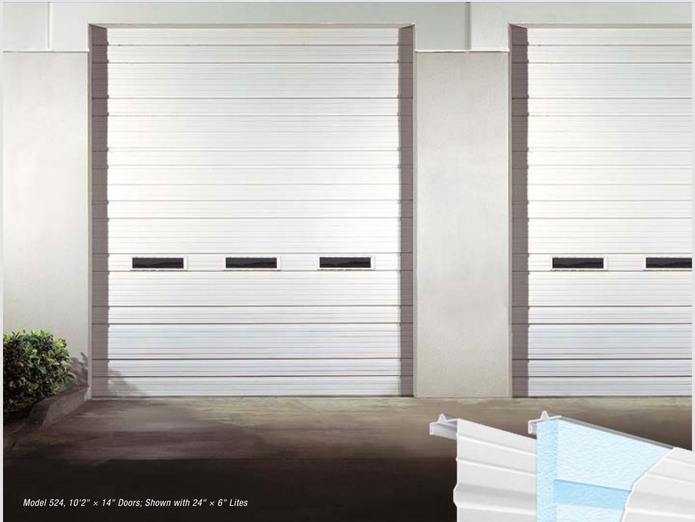
Model 524, 10'2" x 14" Doors; Shown with 24" x 6" Lites